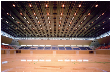
A Main arena