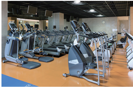
D Training Room