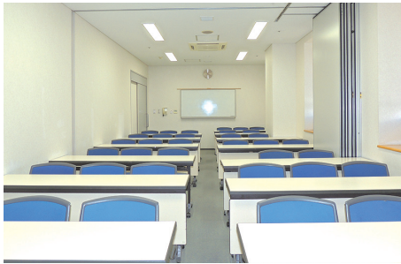
F Lecture Room (A)