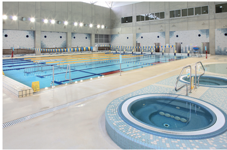
E Heated Pool