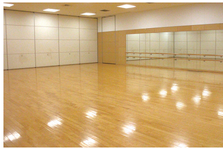
C Multipurpose Room