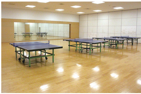
C Multipurpose Room